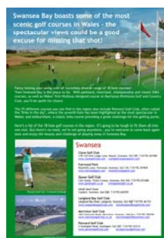
Golf Flyer for Ryder Cup visitors