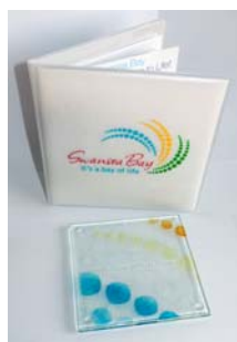
Glass Coaster Gift